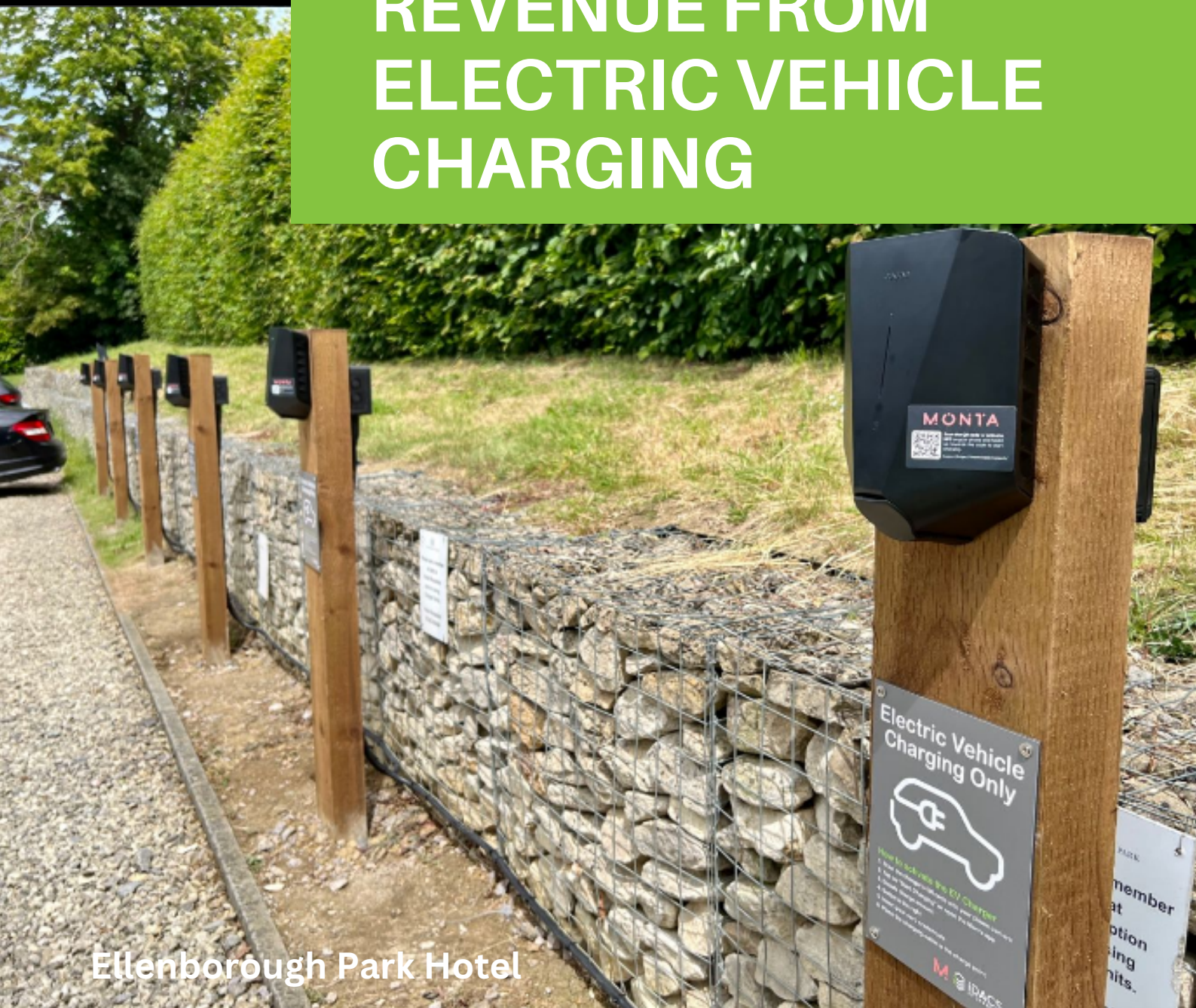
Ellenborough Park Hotel